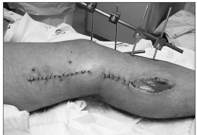
Figure 3 - Medial accesses to popliteal artery in supra and infragenicular portions.