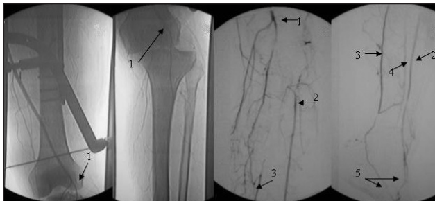
Figure 1 - Arrow 1 indicates popliteal artery disruption. Arrows 2, 3, 4 and 5 indicate the refilling of anterior tibial, posterior tibial and fibular arteries, and plantar arch, respectively.

After the exam, a revascularization of the limb was indicated in a joint procedure with the Traumatology and Orthopedics team. After external fixation of the knee, the popliteal artery, in its supra and infragenicular portions,