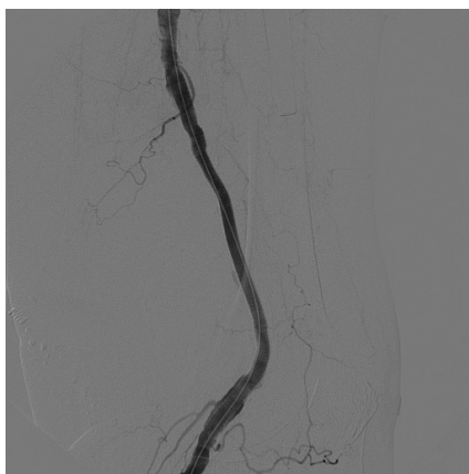
Figure 3. Intraoperative image after aneurysm repair using GORE® Viabahn stents.